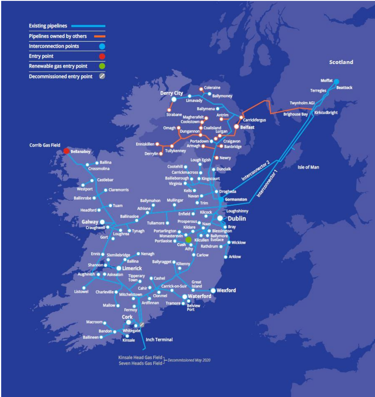
Figure 4.1 GFS Plan Area

The GFS Plan area is identified in Figure 4.1.