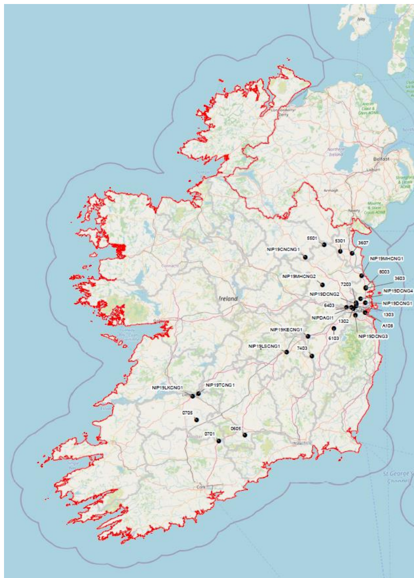
Figure 1.2: NIP Plan Area (numbers represent propose Capital Investment Projects)