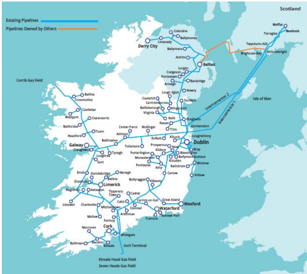
Figure 4.1: NDP Plan Area