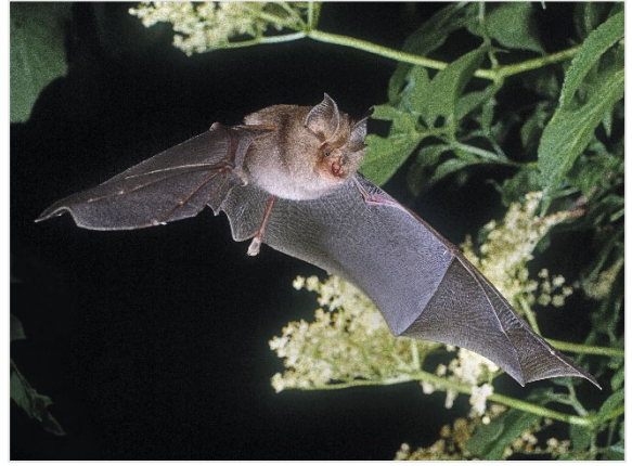
Lesser Horsehoe Bat