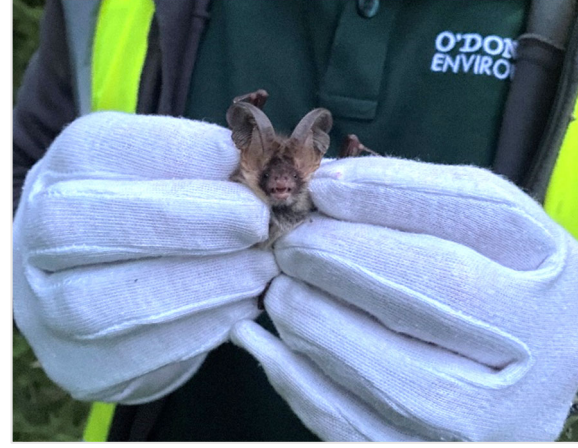
Brown Long-eared Bat