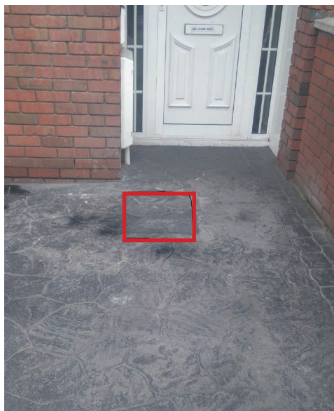
Temporary reinstatement on printed concrete.

If grass areas are damaged during excavation work, our crew will endeavour to repair it, including reseeding if necessary. Repairs to flower beds and grass areas may be delayed due to seasonal factors.