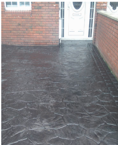
Permanent reinstatement on printed concrete.