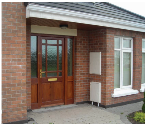
Example of a meter box in an area with the potential to be enclosed.

There will be no cost to you for the work carried out. Please note however that it will result in the temporary disconnection of your gas supply.