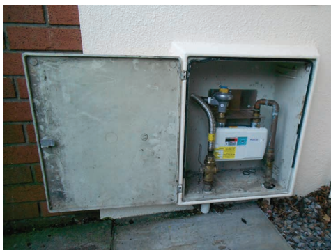
The meter box and area surrounding the meter prior to service renewal.