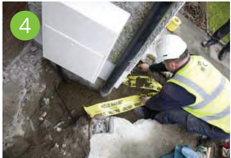
Gas Networks Ireland crew prepare the ground for a temporary reinstatement and will return within 20 days to reinstate the area permanently. (Where Gas Networks Ireland carry out the excavation).