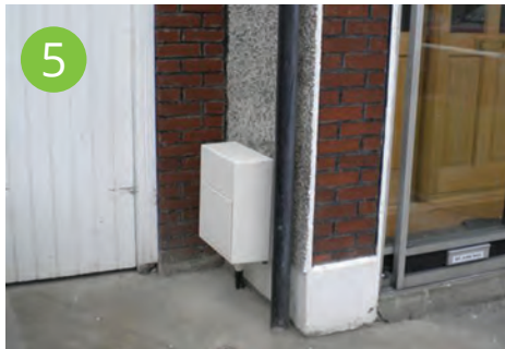
Alteration and final reinstatement complete.

You can also view our alterations video at www.gasnetworks.ie/moveyourmeter for more information.