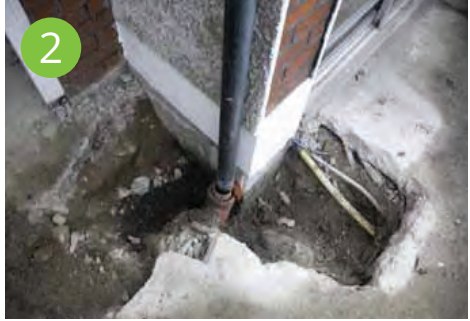
Area excavated to re-route pipework for alteration and meter above.