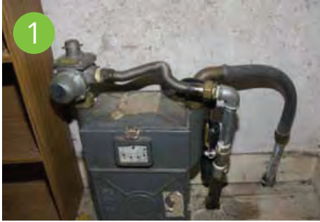
An example of an internal meter which needs to be relocated.