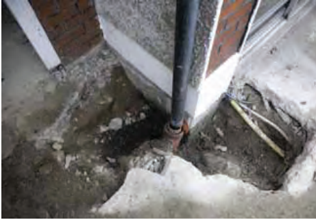
Gas Networks Ireland excavation.