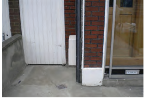
Gas Networks Ireland reinstatement.

Generally, the customer will arrange for the excavations, as this significantly reduces the cost of the job.