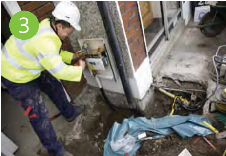
Gas Networks Ireland crew installing the relocated external meter.