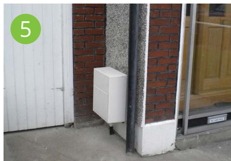
5 Alteration and final reinstatement complete.

You can also view our alterations video at www.gasnetworks.ie/moveyourmeter for more information.