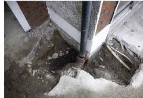
Gas Networks Ireland excavation.