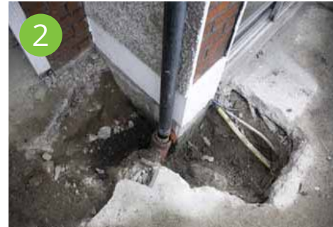
2 Area excavated to re-route pipework for alteration and meter above.