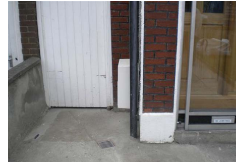
Gas Networks Ireland reinstatement.

Generally, the customer will arrange for the excavations, as this significantly reduces the cost of the job.