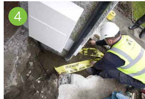
4 Gas Networks Ireland crew prepare the ground for a temporary reinstatement and will return within 20 days to reinstate the area permanently. (Where Gas Networks Ireland carry out the excavation).