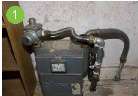
1 An example of an internal meter which needs to be relocated.