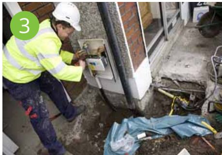
3 Gas Networks Ireland crew installing the relocated external meter.