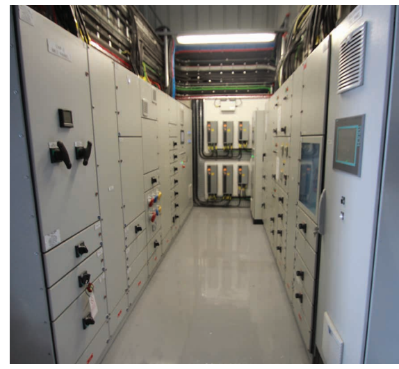
Site Specific SCADA system